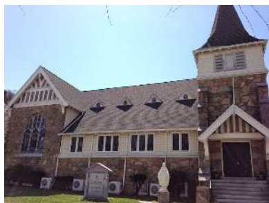
St. Matthews Syriac Orthodox Church