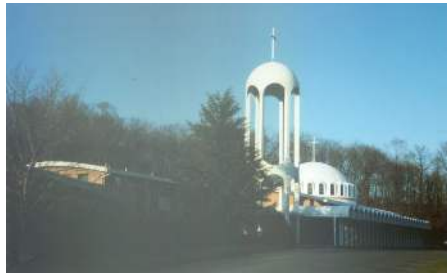
Our Lady of the Annunciation Cathedral