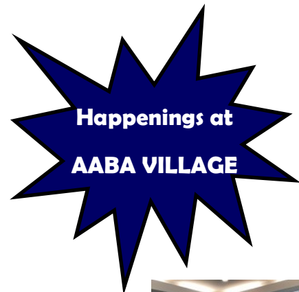
Magic Show 3/13/24