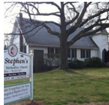
St. Stephen's United Methodist Church, West Roxbury